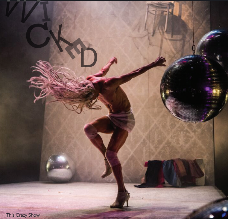
This Crazy Show