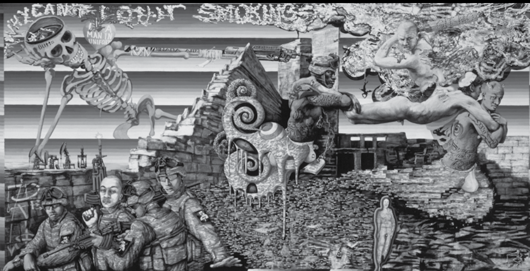
7 Devils Dead by Attila Richard Lukacs

visual art performance dance music media art workshops theatre literature