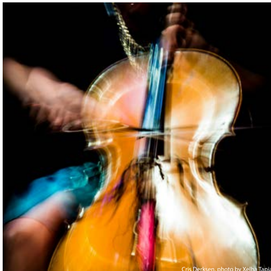
Cris Derksen